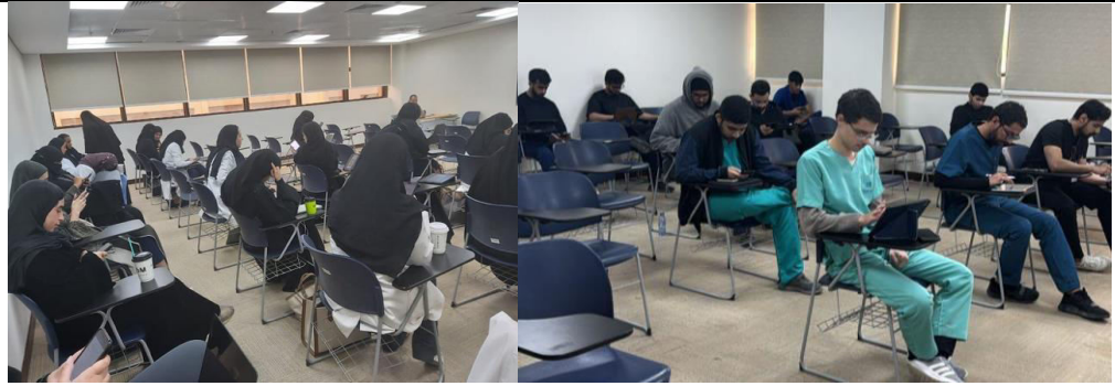
Students in ALMaarefa University during data collection session.