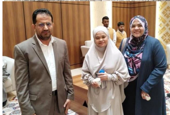
Meetings with the President, Research Dean and Head of CSIS of ALMaarefa University.