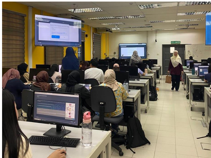
Data collection was held at MM6, FSKTM UM.