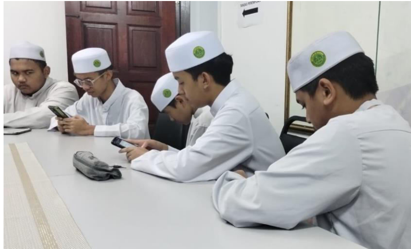
Data collection was held at Maahad Tahfiz Integrasi Dar Al-Hikmah.

In Malaysia, data was collected from both secondary and tertiary-level students within the Klang Valley. On 10 th January 2025, data collection took place at Maahad Tahfiz Integrasi Dar Al-Hikmah, followed by another session on 13 th January at the Faculty of Computer Science and Information Technology (FSKTM) with university students.