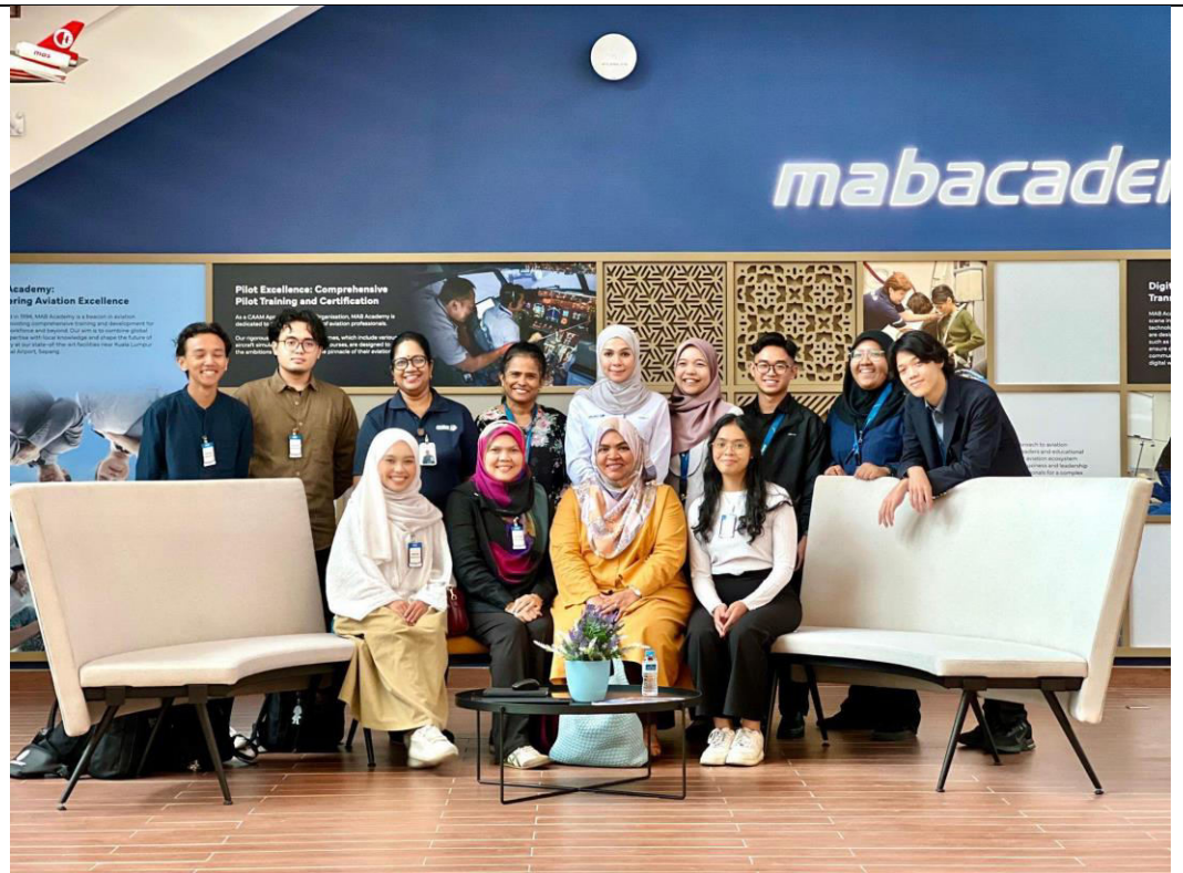
UM team with First Aid Maba team.