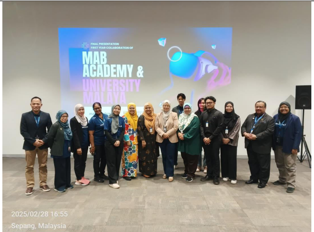
UM team and MABA team during final presentation.

Multimedia Unit, Department of Computer Systems and Technology, Faculty Computer Science & Information Technology, Universiti Malaya