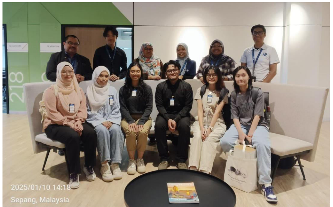
UM team (First Aid and Dangerous Goods) with Maba team.

The project collaboration emphasized the creation of VR and AR-based learning applications to revolutionize aviation training, offering airline staff immersive and interactive educational experience. A cornerstone of the initiative was the digital transformation of Malaysia Airlines' training content, modernizing conventional materials into dynamic and engaging technology-driven modules. Significantly, applications of two projects were created: one specifically designed for First Aid training for cabin crew, and the other focused on Dangerous Goods Handling training for airline and cargo personnel. These applications provide airline personnel with practical, hands-on training through cutting-edge digital platforms, enhancing both engagement and competency.