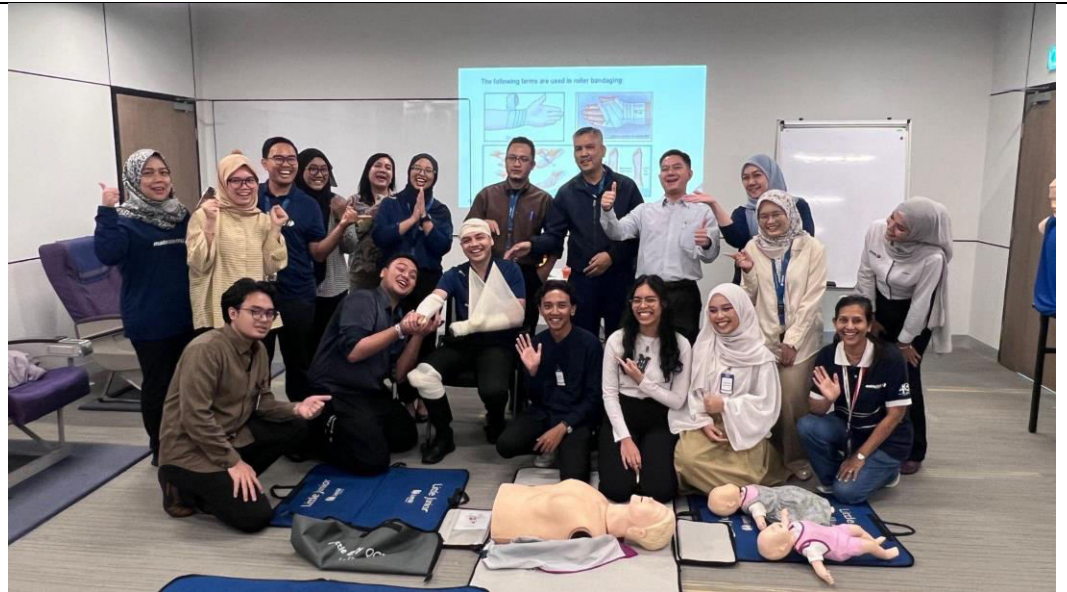
UM students with First Aid Maba team demonstration.