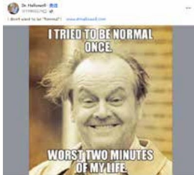
Figure 7. Screenshot of Ned Hallowell’s Facebook Post on August 29, 2013.

understanding of their own shortcomings and challenges, and their ability to easily express the problems they face in life in a playful way without feeling inferior or hurt. This self-deprecating ability enables them to manage demanding situations in life while also making others feel relaxed and comfortable. For example, ADHD individuals may jokingly refer to themselves as “memory leaking like a sieve” or evaluate their brain as an “unstoppable advertising machine” that is constantly emitting random tangential thoughts. This humorous expression helps them establish better relationships with friends and family, as those around them can understand and empathize with their challenges. On Ned Hallowell’s social media, his self-deprecating and humorous qualities are seen as follows: