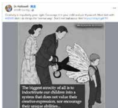
Figure 4. Screenshot of Ned Hallowell’s Facebook Post on December 19, 2018.

“Creativity is impulsivity gone right. Encourage it in your child and use it yourself. Most kids with #ADHD don’t do things the ‘normal way’. Don’t feel bad about this!” (Figure 4)