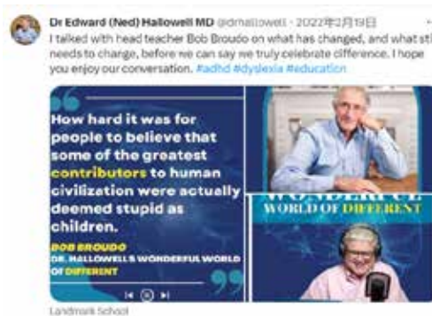
Figure 2. Screenshot of Ned Hallowell’s Twitter Post on February 19, 2022.

“How hard it was for people to believe that some of the greatest contributions to human civilization were actually deemed stupid as children.” (Figure 2)