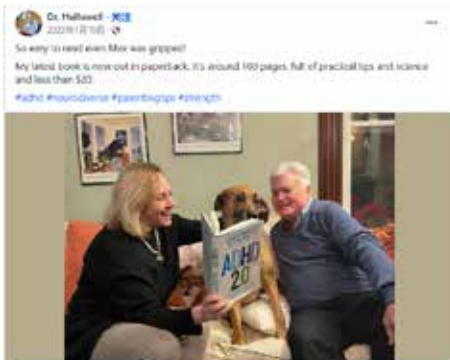
Figure 5. Screenshot of Ned Hallowell's Facebook Post on January 19, 2022.

"So easy to read even Max was gripped! My latest book is now out in paperback. It's around 100 pages, full of practical tips and science and less than $20." (Figure 5)