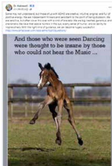
Figure 8. Screenshot of Ned Hallowell’s Facebook Post on September 28, 2012. In the first picture, Ned attempts to be what others call a “normal person” but ends up with even worse failure. The current society is filled with prejudices and stereotypes about ADHD, and there are certain questioning voices which believe that ADHD is abnormal and pathological. He not only demonstrated his tentative attitude towards this controversial view through self-deprecation, attempting to explain the “abnormality” of ADHD, but also

“And those who were seen Dancing were thought to be insane by those who could not hear the Music.” (Figure 8)