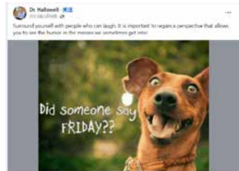
Figure 6. Screenshot of Ned Hallowell's Facebook Post on March 9, 2013.

By emphasizing the unique promotional approach of reading dogs, coupled with their exaggerated and comical expressions, he creates a humorous atmosphere for the audience. The combination of text and animal images has the effect of emitting humour (Figures 5 and 6). Although animals themselves may not necessarily have a true sense of humour, their behaviour and expressions can sometimes make people laugh. The reason these animal images have become laughter points on social media and the Internet and are shared by audiences is because their sense of humour and cute moments can make us laugh, reduce stress, and increase happiness. This sense of humour is a valuable resource for the ADHD community, reminding us to maintain a relaxed and happy attitude in life.