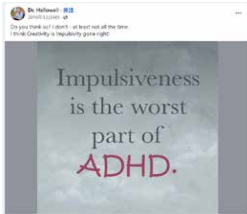
Figure 3. Screenshot of Ned Hallowell’s Facebook Post on December 9, 2016.

“Do you think so? I don’t - at least not all the time. I think Creativity is Impulsivity gone right!” (Figure 3)