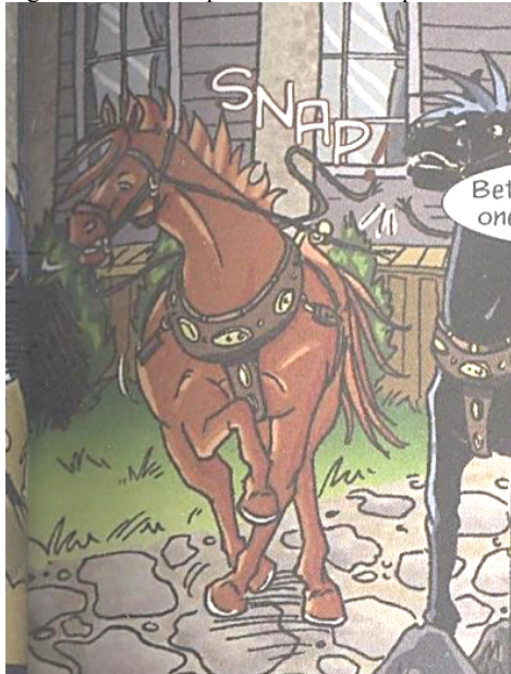
Figure 2: An Example of an Onomatopoeic Word in BB (2010, p. 33)

It must be noted that although this study focuses on transitivity, a few elements must be considered as they are pertinent in representing the themes and subthemes which underpin the ideology of anthropocentrism. The use of special effect words like 'WHUMP' (denoting a hard fall), 'NEEIGH' and 'SNAP' (representing the pain of wearing a bearing rein) and 'GGG' (illustrating the soreness of the tongue and mouth) imbues the narrative with real world sounds to amplify meanings. The salience of these words through deep colours and prominent fonts are clearly highlighted as shown in the example (Figure 1). These words are in capital letters, bold and highlighted without any connectivity. As a result, the focus is purely on the words to further enhance the representation of the ideology and themes. These onomatopoeic words are rendered to further accentuate the sound landscape of the emotions of these horses in pain as a result of mistreatment.